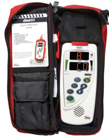
Rad-57 with EMS Carrying Case > PN 2208