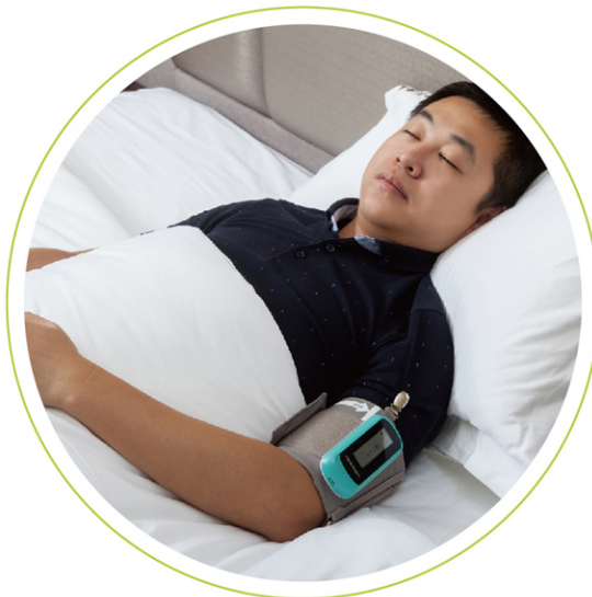
Hingmed WBP-02A Wifi ABPM APP