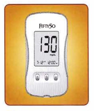
® Result in 5 seconds