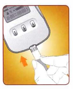
Insert test strip