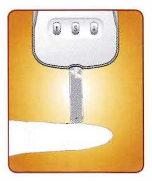
Apply blood sample